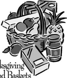
Thanksgiving Food Baskets