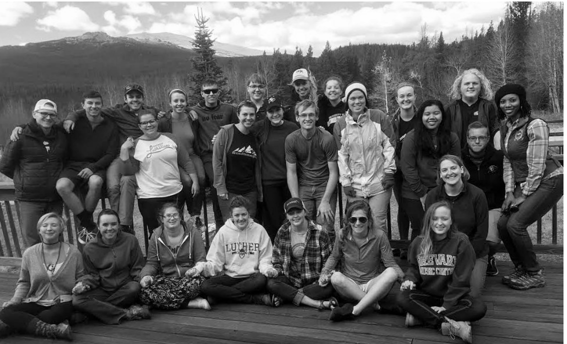
Students and staff from the University of Colorado in Boulder, Colorado State University in Fort Collins, and the University of Northern Colorado in Greeley participate in a fall retreat at Sky Ranch Lutheran Camp.