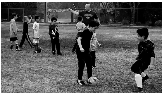
The boys practice ball handling strategies.

This spring we kicked off three new initiatives. The first one was to sponsor a soccer program for third and fourth grade boys at Monroe. Initially, we tried to have four soccer teams start in the fall but that was too many. So we stepped back and started with just one team. We have 15 boys participating with a coach who is a parent at Monroe. Zion financially supported 9 of the 15 boys on the team to make this dream a reality.