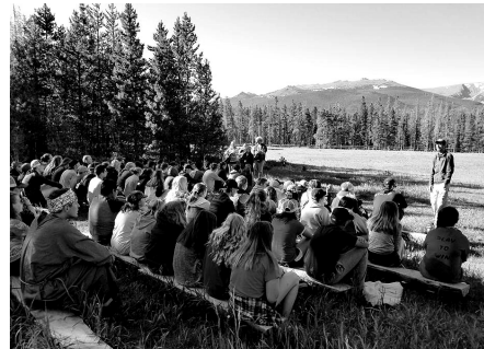
Sky Ranch campers experience God in the mountaintop setting.

Please pray for safe faith-filled experiences for our youth and the staff who will care for them during their time at camp.