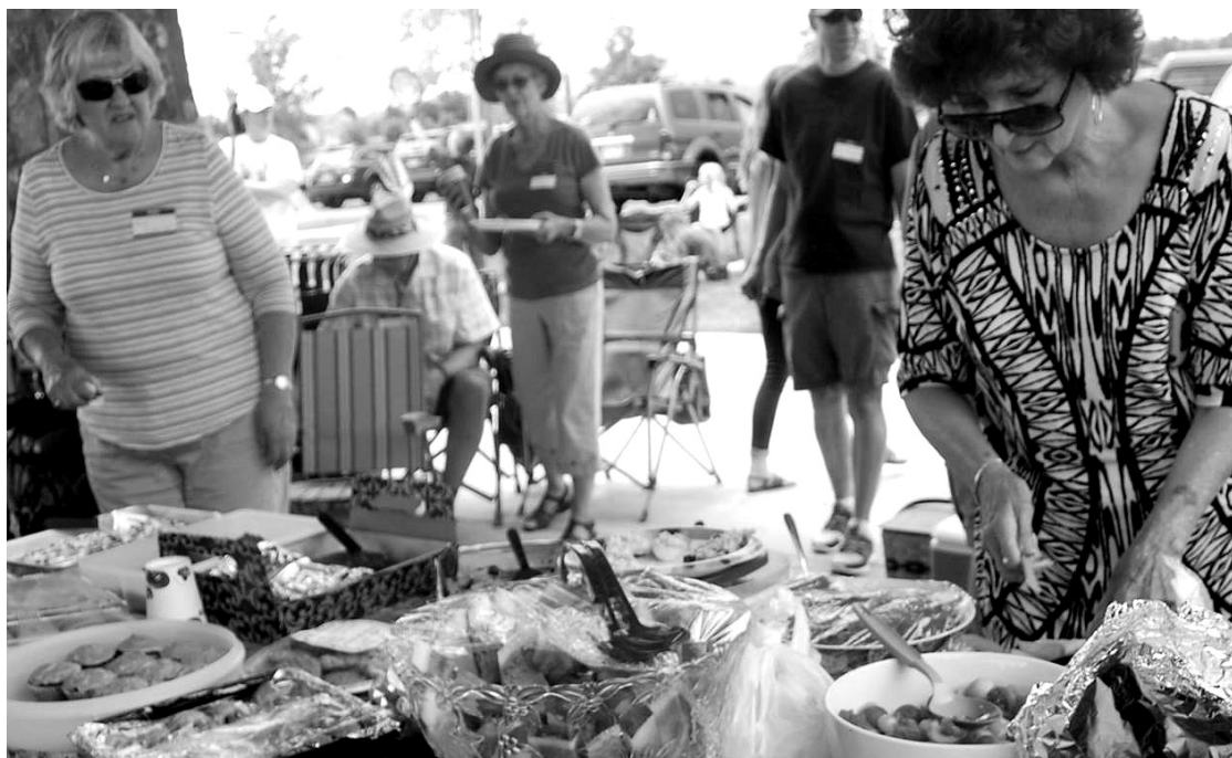
An abundance of food and fellowship were enjoyed at the 2017 all church picnic.

Join Zion and King of Glory members at the pavilion at Mehaffey Park! Bring a dish to share and your own lawn chair! Games and entertainment provided. Enjoy some good old-fashioned picnic fun!