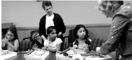
Attentively, young girls learn the skills for sewing by hand.

In April we began to offer short-term, after-school clubs. Volunteers stepped up to share their talents in three areas: weaving, loom weaving, and hand sewing. Each of these three clubs met between two and four times during April. The kids who came had a great time, and we will continue to explore how people at Zion can share their gifts with children at Monroe.