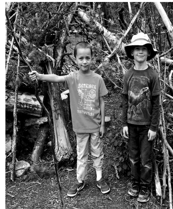
Walking stick in hand, the boys are off for a Sky Ranch adventure.