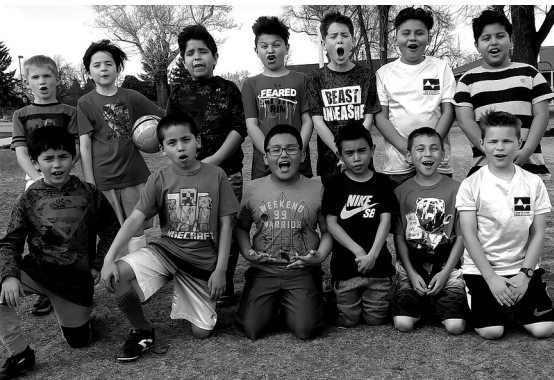
The boys are enthusiastic for soccer.

The coach commented, "They are honestly having so much fun, and I see it giving them a very positive feeling about school as well. I hope we can keep the momentum moving into next year."