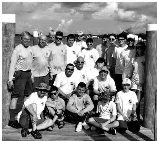
A crew of scouts sailed from the Seabase High Adventure base to the Abacos Islands in the Bahamas.