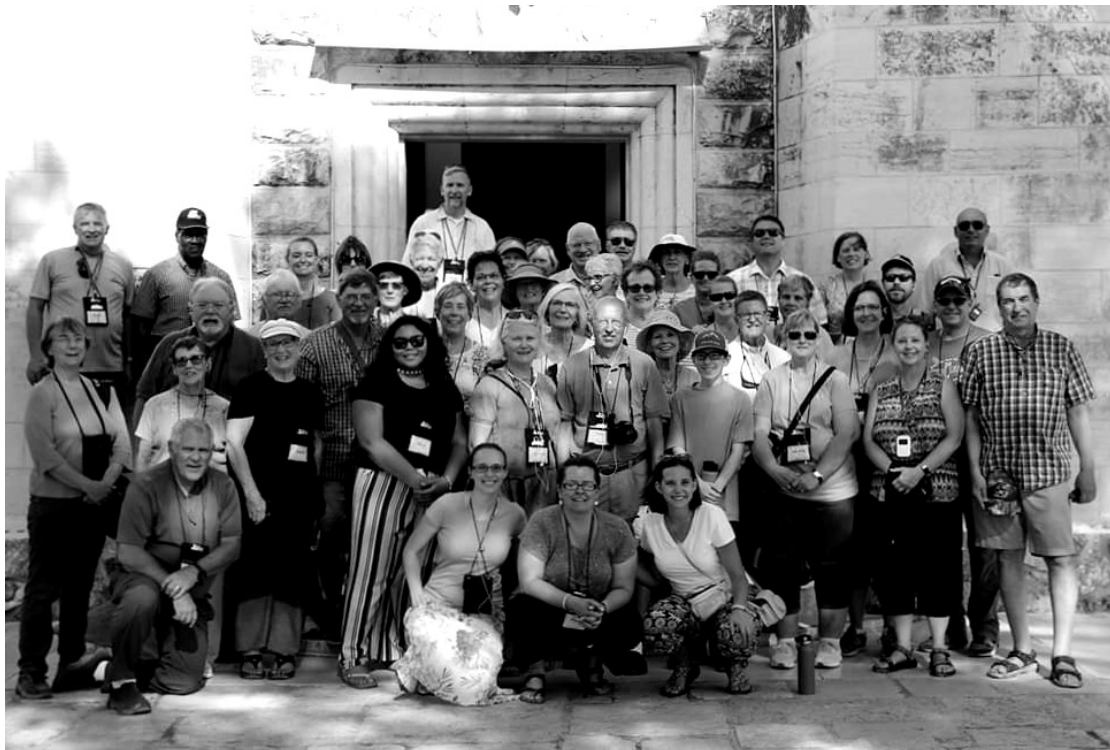
The group of 47 friends and strangers blended well together and cared for each other.