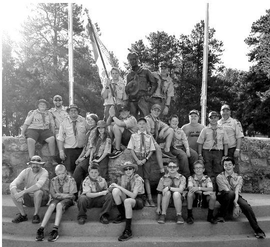
Eighteen scouts attended summer camp at Camp Chris Dobbins at the Peaceful Valley Scout Ranch.