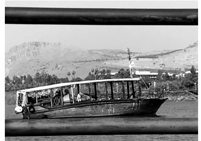
The pilgrims sailed on the Sea of Galilee in a wooden boat.

Now when reading the Bible, it becomes more real. I can picture the area that is being talked about. The two church services and communion at the Mount of the Beatitudes and Garden of the Tomb were very touching.—ARLENE RONEY