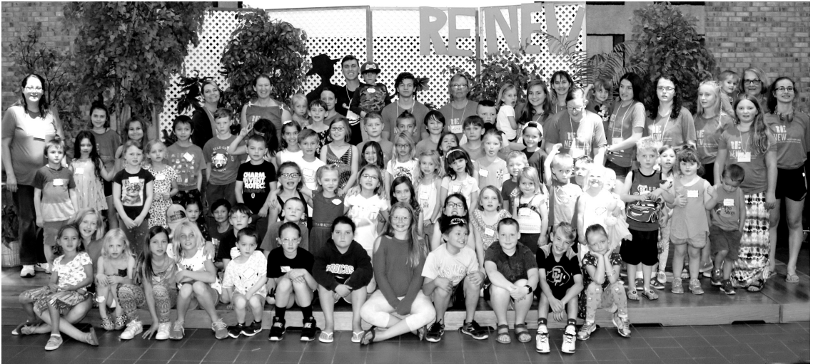
Our VBS kids learned how to care for God's creation as they explored Jesus' Parable of the Sower.

Thank you so much to everyone who was able to volunteer or participate in Vacation Bible School this summer! We had so much fun learning about the Parable of the Sower, caring for creation, and growing in God's love for us at ReNew VBS!