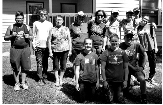
Zion youth and adults repaired homes for the people living on the Northern Cheyenne reservation. GOD'S WORK. OUR HANDS.