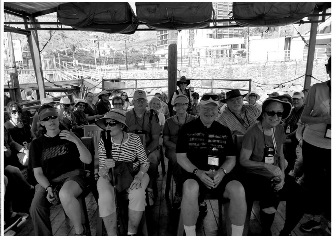
This day was one of calm and serenity aboard ship on the Sea of Galilee.