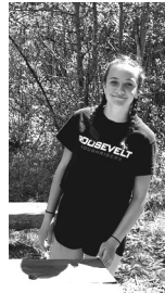
Zion youth encounter Christ on the mountaintops at Sky Ranch Lutheran Camp.