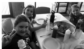
Homesteader girls and Round-Up boys explore the theme "Shine" learning about Christ's light.