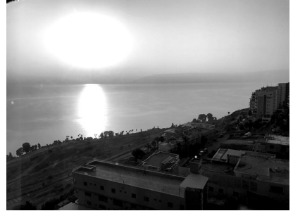
Linda saw the sunrise over the Sea of Galilee from her hotel window.