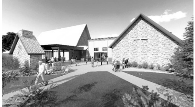
An architectural rendering of Zion improved and expanded as proposed.

Members of Zion are asked to attend this important meeting as we vote whether to proceed with capital improvement and expansion. For a month prior, the council and building design team have been sharing the vision of a project that answers some of the needs for an aging building. This vision lays out a plan that looks to serve our community in the following ways: