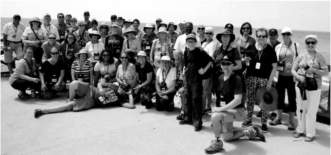
The pilgrims included people from Colorado, Florida, Montana, and Virginia, all coming together to walk in the footsteps of Jesus in the Holy Land.