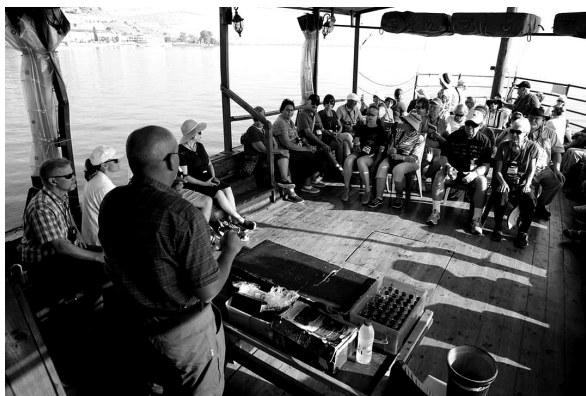
The pilgrimage included a cruise on the Sea of Galilee.