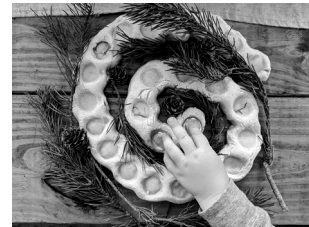
All are invited to make their own salt dough spiral wreath at the Advent workshop.