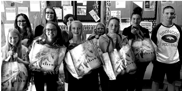
Zion youth assembled Thanksgiving dinner baskets for Monroe and Thompson Valley Preschool families.

Thank you to everyone who has donated items to make Thanksgiving dinner baskets again this year. Donation items are due back to Zion by November 10. Your contributions will provide the ingredients for 30 Thanksgiving dinners for families of students at Monroe Elementary and Thompson Valley Preschool. Preschool through high school youth will assemble these baskets together on Sunday morning, November 17, during the Sunday School hour from 9:40 to 10:30 a.m. Afterward, everyone will gather in fellowship hall to make their own gratitude jars.