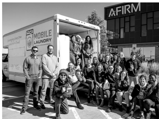
In this side view of the mobile laundry truck, if you look really closely, on the side of the truck just behind the people you will see Zion's logo.

The mobile laundry truck is set to begin its mission in early November. If you are interested in volunteering, stay tuned for further details. We are hoping there might be an opportunity to offer our time while the truck is parked here at Zion or Monroe.