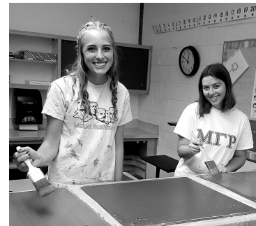
With the exception of one Sprain, dynamic duos wielded their brushes to paint up a stunning result at Monroe Elementary.