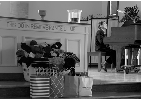
Donations to Monroe were blessed during worship.