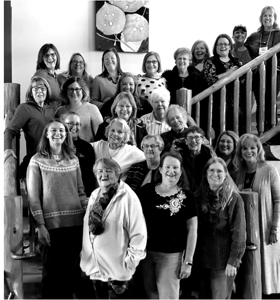
The women are all smiles in this group photo.