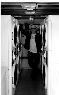
The laundry truck houses stackable washers and dryers.

What is a mobile laundry truck? It's a vehicle containing eight washers and nine dryers (because it takes more time to dry clothes than wash them), completely self-contained and mobile. Mobile laundry trucks are serving low-income and homeless residents in cities around the country (Denver, Seattle, and New York), and now we have one serving Fort Collins and Loveland!