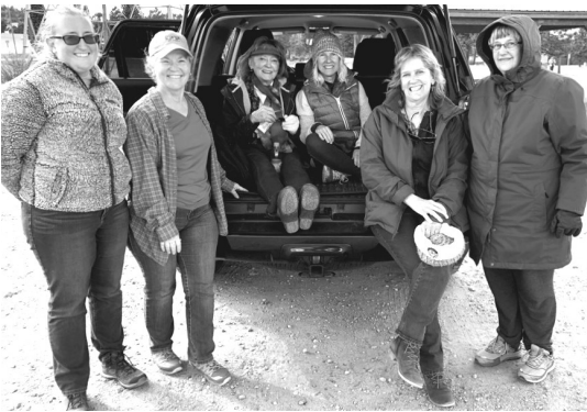
Some went for a hike in their free time.