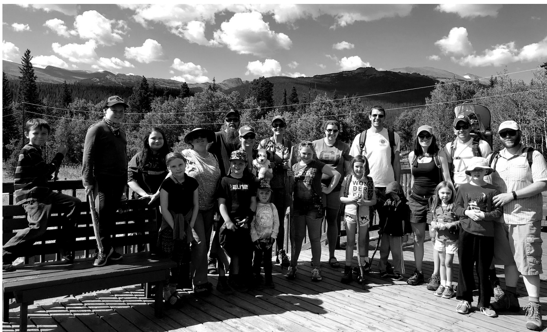
Families hiked together at Sky Ranch over Labor Day weekend.