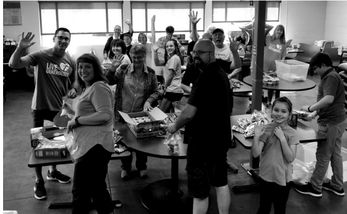
This group is at Community Kitchen putting together snack bags to give to clients who come for a meal and need food for later in the day.