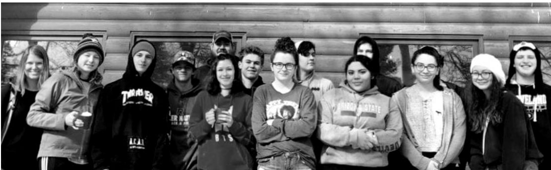
Zion high school youth enjoy a retreat of skiing and snowboarding at Monarch Mountain.