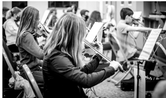
Zion's fellowship hall provides a safe environment for The Northern Colorado Youth Orchestra to rehearse.

grounded during this deafening silence and has served a flagship of perseverance throughout this trying time. Over the course of their short existence, the orchestras have continued growing both in size, but also in excitement and enthusiasm as our first performance draws closer. There are many gifts in our world, but few are as priceless as the feelings of hope and of the possibilities that lay ahead. This would not have been possible without the Zion community, and for that, we are eternally grateful.