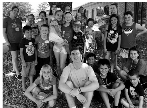
Maskless, lacking social distancing, this photo reflects Vacation Bible School of another era—one to which we hope to return and again see the smiling faces as beaming from these kids.