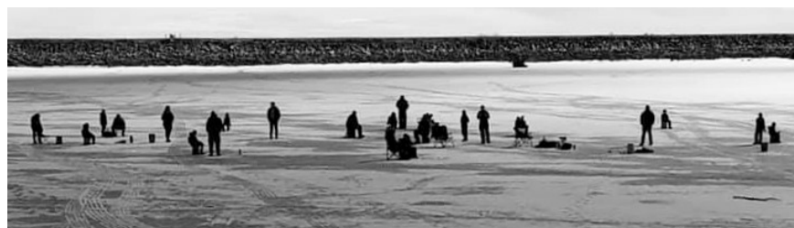
The Cub Scouts had a big turnout for their ice fishing adventures in January.

Ice fishing adventures! The last Saturday in January had the scouts out ice fishing at Lon Hagler Reservoir. We had a Wildlife Conservation Officer come share information with us and he brought with him a mountain lion and bear fur.