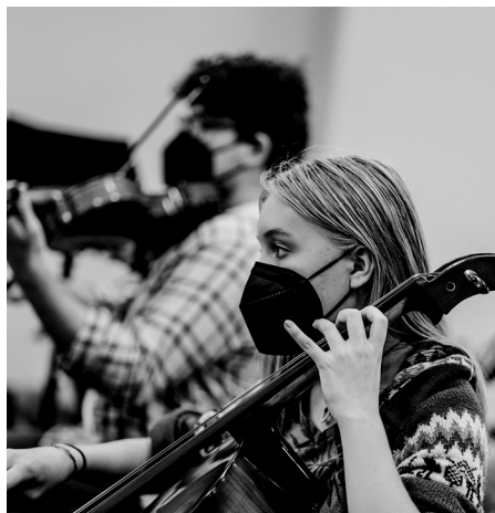
NoCoYO offers opportunities for beginning, intermediate, and advanced students.

Be sure to join us on April 27 for our spring concert. You can learn more at www.nocooyo.org .