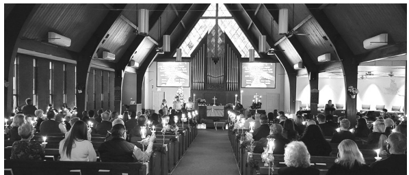
Children and their families helped lead worship at the family-friendly service.