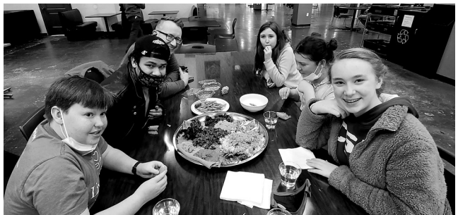
Part of the urban plunge experience was eating ethnic food such as this Ethiopian lunch.