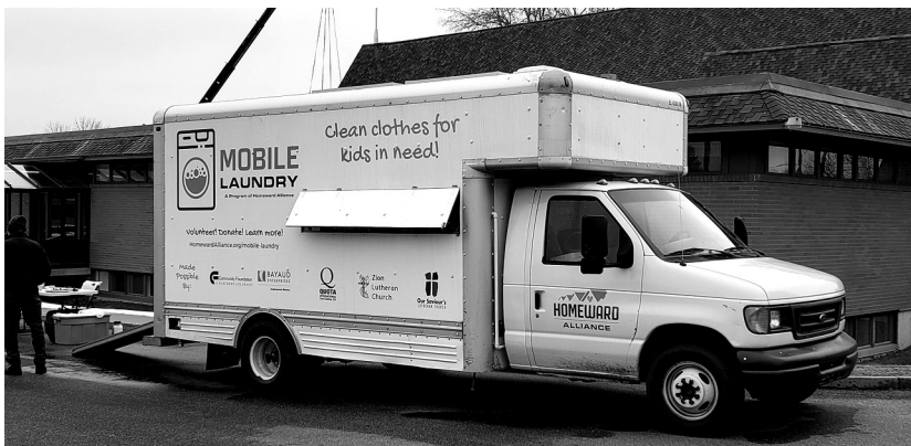
On Thursdays and Fridays, the Mobile Laundry truck is set up at the Loveland Public Library serving people in need in our community. They are in need of volunteers to sustain their operation.

If you are willing and able and have the time, go to the Homeward Alliance website at https://homewardalliance.galaxydigital.com/need/ , create an account, and sign up for mobile laundry shifts. If you are interested but need help signing up, contact the church office. Shifts are about three hours long, Thursday and Friday mornings and afternoons. Volunteers work outside so it can be cold, but it will warm your heart to serve our families, friends, and neighbors in need.