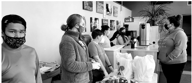
The youth served breakfast to people experiencing homelessness.

On January 22, middle school youth participated in an “urban plunge” in Denver. They started the day serving breakfast at Open Door Ministry to those experiencing homelessness, then brought dignity to those who enter that place by doing a deep clean of the family room where they eat. The youth also had the opportunity for personal interactions with people in the streets of Denver and enjoyed ethnic food from Ethiopia, Syria, and Japan.