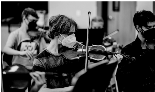
Students create music in person in a safe environment.

The Northern Colorado Youth Orchestra is certainly feeling “full to the brim” these days! We had a wonderful winter concert in early January at Mountain View High School where we were fortunate enough to have over 350 friends and family safely attend. Since then, we’ve hit the ground running beginning our second semester. We are currently preparing for our trip to Atlanta, Georgia, in March where our Chamber Orchestra will perform at the American String Teachers Association’s National Orchestra Festival. It’s going to be a busy and abundant month! The students are having a great time playing music from Mozart Concertos to Balmages Fanfares.