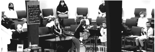
The children led a joyful worship with narration and music.