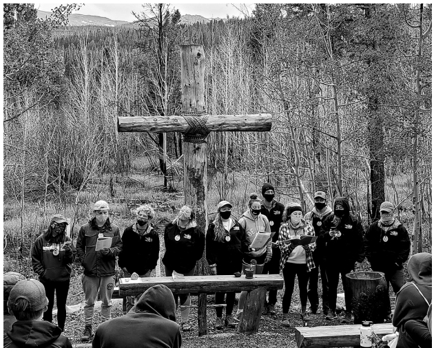
Many of the summer staff fell in love with the camp first as campers.