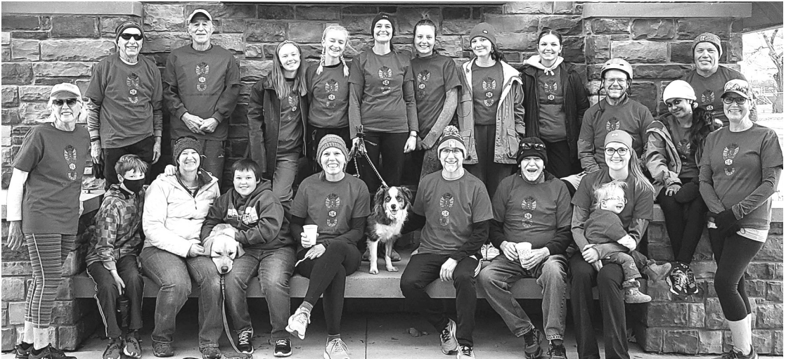
Members and friends from King of Glory, Trinity, and Zion ran, walked, or biked in the Run4Camp event to raise money for Sky Ranch Lutheran Camp.