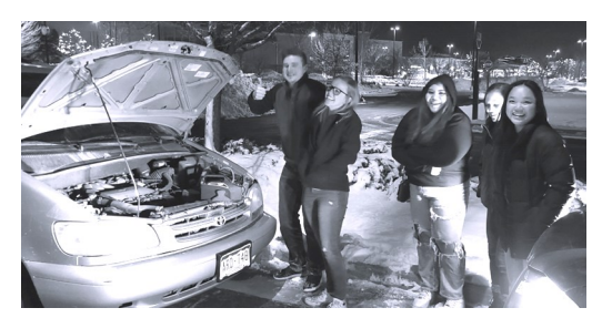
All are smiles during an unexpected team-building exercise to change a car battery!