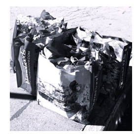
Zion provided more than a trunkful of gifts to Monroe at Christmas time.