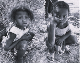
The hair of these young girls has a red tinge indicative of their being malnourished. Irrigation surrounding this well will help produce crops.

within a context where extreme poverty threatens everyone. The temptation is palpable for someone to steal solar panels and sell them for a quick gain, in spite of the long-term loss for the whole community. A high post, and a covenant made by the community to guard all the property for the shared good of everyone, are major components to the sustainability of these efforts.