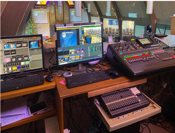
Equipment up in sound booth. From left PC for projection (ProPresenter), PC for video editing (vMix) and also Zoom broadcast, Mixer board for sound Behringer X32, and below control panel for spot lights.