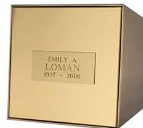
A Polished Bronze Urn containing a person's ashes will be inserted into the Columbarium Niche

The Columbarium Walls designed for Zion's Memorial Garden have thirty (30) niches. Each niche has space for two urns. The cost of one niche, whether it holds one urn or two, is $2,000, and includes a polished bronze urn, engraved stone face plate, and perpetual upkeep of the Memorial Garden. Cremation and services at the time of the funeral, memorial, or interment is not included in the cost.